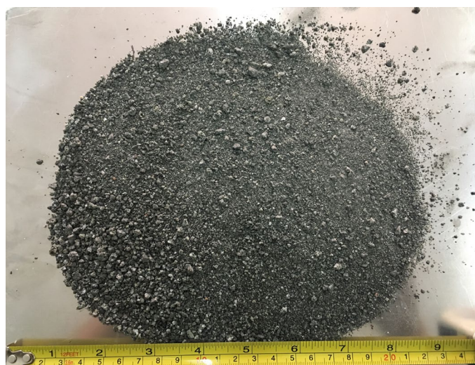
Fig. 1. The appearance of palm oil clinker powder

POC was used as the raw material in this study. This solid waste was collected as the by-product of mesocarp fibres and oil palm shell burning at high-temperature incineration from a palm oil mill at Lepar Hilir, Malaysia. Clinker appeared in blackish-grey colour, as shown in Fig. 1. In its raw state, POC was low in reactivity and porous in nature. Therefore, additional treatments were needed to enhance its pozzolanic reactivity.