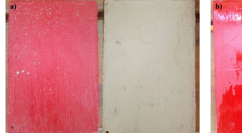
Fig. 1. Steel painted samples: a) below the water surface; b) above the water surface

Thickness. The thicknesses of the coatings were tested with a use of Phynix Surfix measuring equipment.