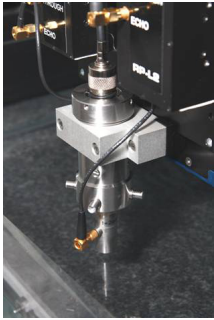
Figure 2. The prototype of the transducer protection device mounted on the EVO II acoustic microscope (manufactured by KSI) to protect the scanning head

The operation of the transducer protection device was verified in practice with great success, which proved the device to protect efficiently the transducer of the EVO II acoustic microscope used in the research laboratory at the Institute (Fig. 2). The efficiency of the transducer protection device was also confirmed during sophisticated operational tests, directly at the manufacturer's of acoustic microscopes (Kraemer Sonic Industry, Germany).