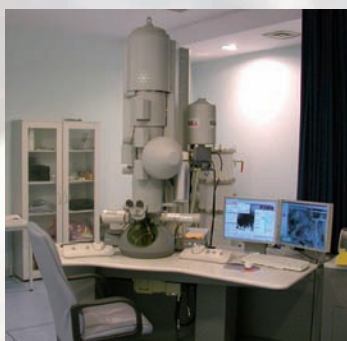
TEM (Philips CM20 200kV Twin with EDS system from EDAX, Tecnai G2 F20 200kV with FEG and EDS system from EDAX) microstructure (bright and dark fields, electron diffraction) microchemical analysis