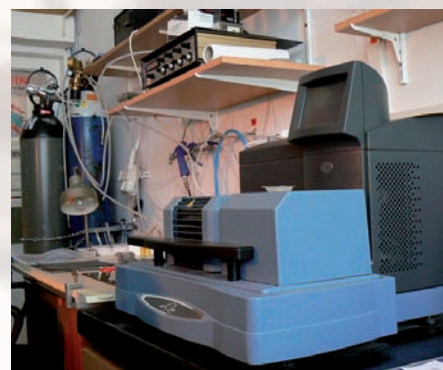
Thermal Analysis Instruments DSC Q1000 TA; SDT Q600 TA; DTA DuPont 1600 scanning differential calorimetry