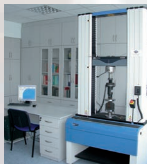
Instron Model 3382 testing of mechanical properties (tensile and compression) at 100kN load