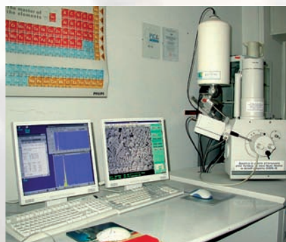
Scanning Electron Microscope 1. Philips XL 30 with Link Isis EDS system from Oxford Instr. 2. FEI E-SEM XL-30 with EDS System from EDAX GEMINI 4000) microstructure microanalysis electron backscattered diffraction (EBSD)