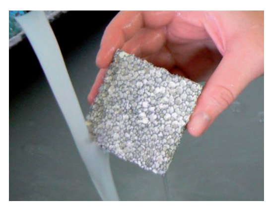
Fig. 5. Flushing of plaster in water

Dissolution of superfluous plaster in water (see Fig. 5) appeared to be an unsuitable method. The plaster forms a compound CaSO_4 ·2H<sub>2</sub>O, which is insoluble in water.