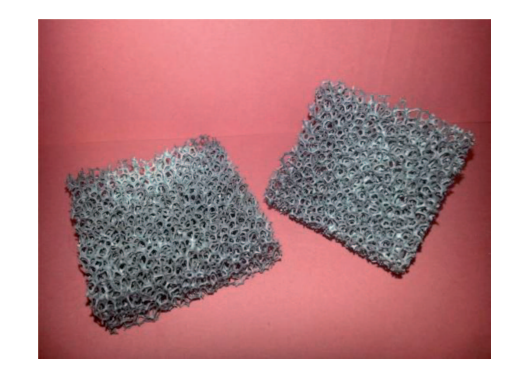
Fig. 7. Castings after removal of plaster in 1M solution of HNO3

The procedure itself consists in dissolution of plaster in 1M solution of nitric acid HNO_3 during 1 hour, followed by flushing and drying of the casting. Fig. 7 presents perfectly cleaned castings.