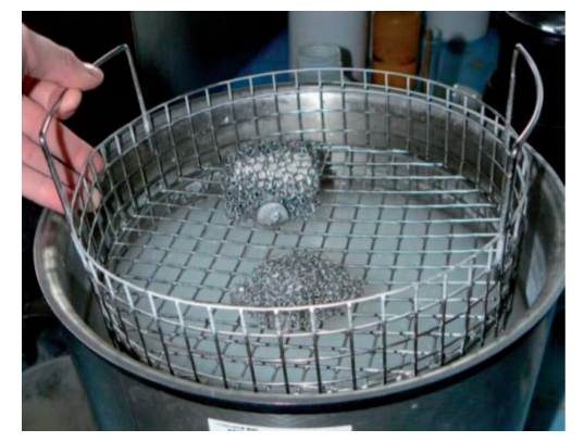
Fig. 6. Cleaning of metallic filters in ultrasonic bath

Use of ultrasonic bath for removal of plaster from metallic foam gave better results (see Fig. 6). This procedure is efficient, but it is rather time consuming (action of ultrasonic bath must last for 12 hours).