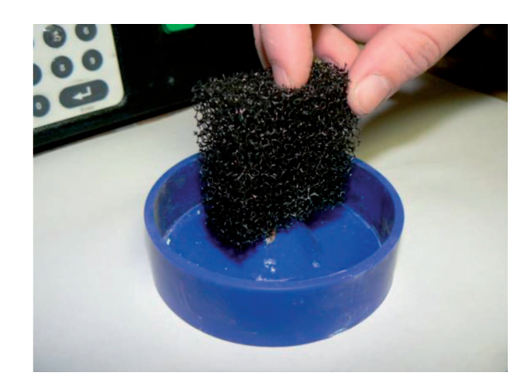
Fig. 2. Polymer foam

to fire the plaster and remove the polyurethane foam. Molten metal (aluminum alloy) is then poured into the mould – again, combinations of vacuum and high pressure casting can be used to ensure full infiltration. The plaster is then dissolved, to give a net-shape metal foam with an identical structure to the original polymer foam [4, 8] (see Fig. 1-4).