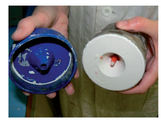
Fig. 3. Plaster mould